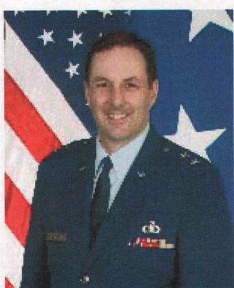
Major General Craig E. Campbell

The $10 million dollars to complete the ALMR infrastructure build out will come from $7.5 in federal grant funds and the $2.5 million currently requested from the Alaska State Legislature.