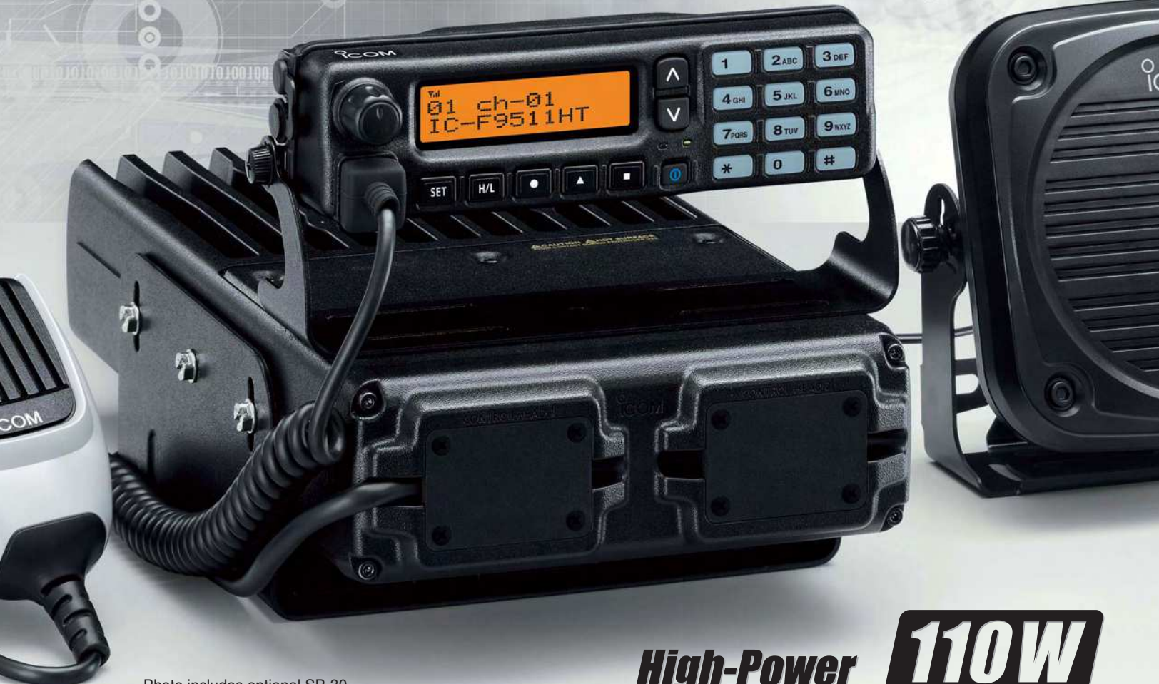
Photo includes optional SP-30.