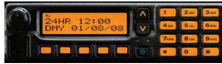
Internal clock setting example

With a high contrast dot matrix display, upper and lower case characters can be easily distinguished. The display shows 12 characters by 2 lines. LCD backlight is standard.