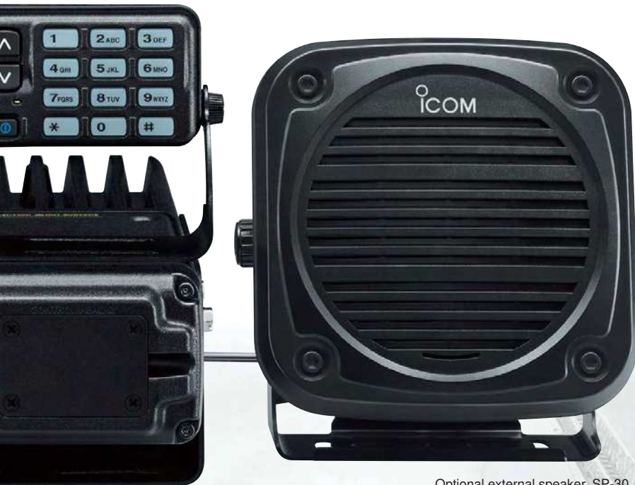
Optional external speaker, SP-30