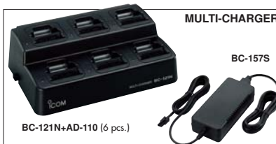
BC-121N+AD-110 (6 pcs.) BC-157S

BC-119N DESKTOP CHARGER + AD-110 CHARGER ADAPTER + BC-145SA AC ADAPTER Charges the BP-254. Charging time: approx. 4 hours when BP-254 is at- tached.