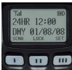
Internal clock setting example

The IC-F9011T/S and F9021T/S have a large dot-matrix display to show various operating status at a glance. At the bottom line of the display, the key indicator shows the assigned functions to the [I], [II] and [III] buttons for more efficient operation.