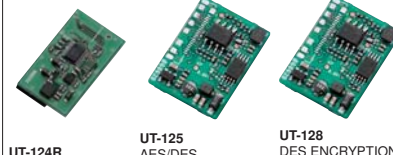
UT-124R UT-125 UT-128 MAN DOWN UNIT AES/DES ENCRYPTION UNIT DES ENCRYPTION UNIT

UT-124R : Provides a measure of safety when working in a hazardous environment, etc. UT-125 : Provides AES and DES encryption capabilities. UT-128 : Provides DES encryption capabilities.