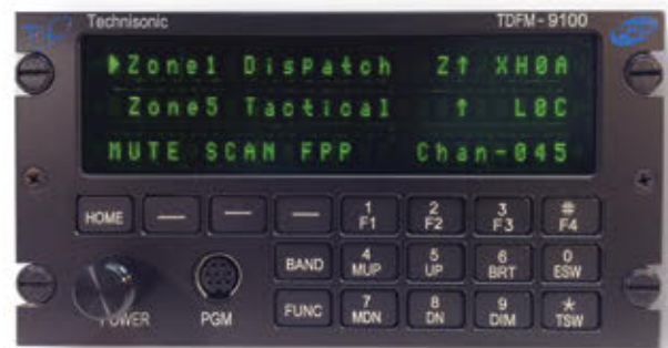
The TDFM-9100 is designed to meet the demands of Airborne Law Enforcement and EMS operators.