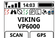
Day - High Contrast