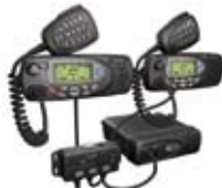
Dual head configuration with FSTN LCD for use in cooler climates (a Control Head Interface Box is required)