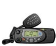
Standard control head with keypad microphone