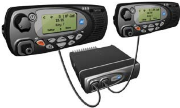
TM9155 P25 Mobile radio shown in optional dual head configuration