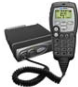
Local hand-held control head