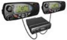
Dual head configuration with STN LCD for use in warmer climates